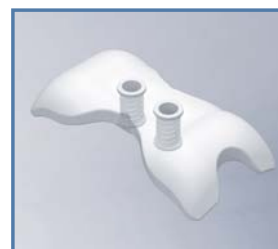
3D Pre-formed Design