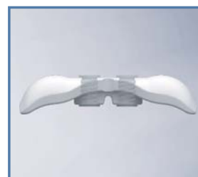
Stable drilling with enough sleeve

To shorten making time 3D Pre-formed Design